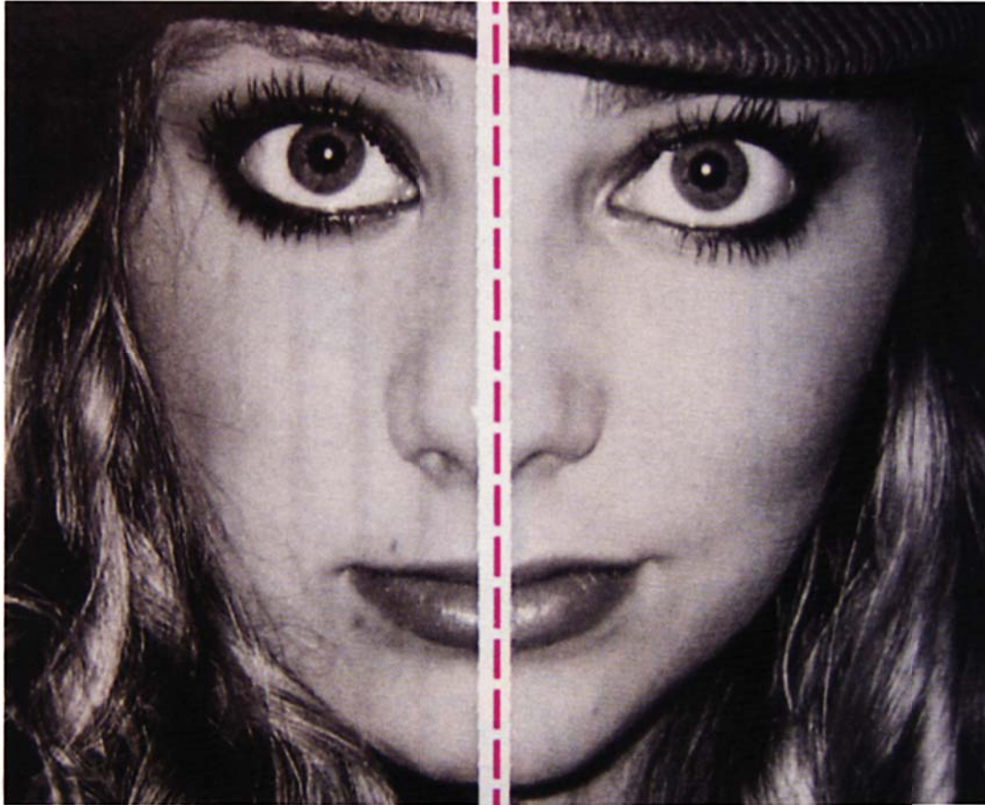
A typical photopolymer plate was used for the left side of the image, and clearly shows fluting. The right side used the flat-topped dot technology.

that our Mac operators enjoy immensely," said Price. "Though we have not created such images previously, we determined the feasibility first, and then learned how to combine two images taken at slightly different viewing perspectives into a single anaglyph image."