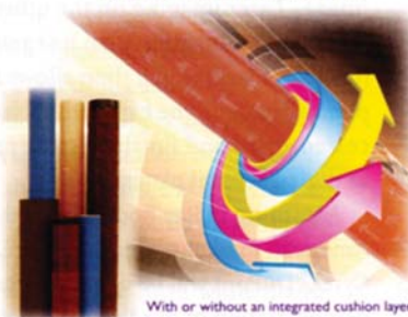
With or without an integrated cushion layer

We can also fulfill all of your Flexo Prepress Needs.